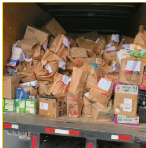
The Hope Partners' truck filled to the brim with donated food collected by Temple Beth Israel as part of its annual High Holy Days Food Drive.