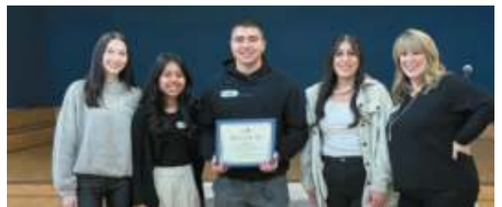
Cal Poly Pomona