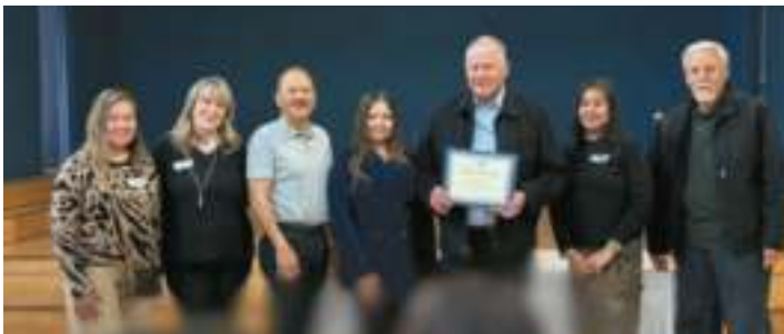
Consecrated Bible Church