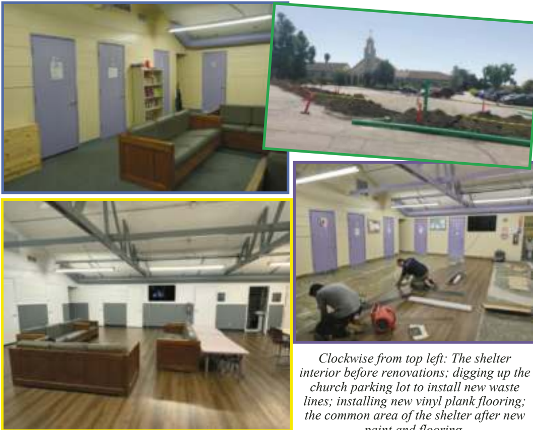
Clockwise from top left: The shelter interior before renovations; digging up the church parking lot to install new waste lines; installing new vinyl plank flooring; the common area of the shelter after new paint and flooring.

We've got a few more beautification and safety projects to check off our list in the coming months, namely new gates and fencing, a revived yard, and new common area furniture, but we couldn't resist giving you a small sneak peek of the improvements that have been made at the shelter. These projects have been crucial in providing a safe and comfortable environment for the families and individuals we serve.