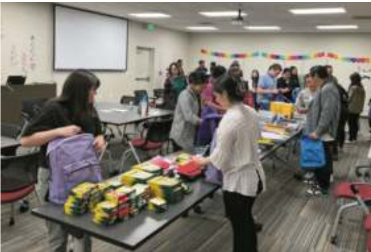
Employees from CliftonLarsonAllen LLP volunteer to put together backpacks filled with supplies for children as part of last year's School Supply Drive.

Help Hope Partners provide these items to the low-income children we serve by hosting a school supplies drive or simply adding a few basic back-to-school items to your own shopping list.